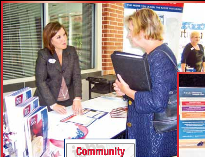
Community Job Fair Connecting Employers & Employees April 18