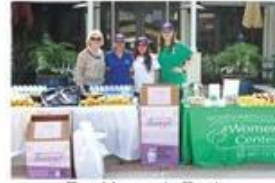
Two Men and a Truck

is called Movers for Moms and several area businesses and organizations partnered this year.