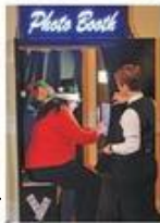
Market Street Photo Booth

Market Street Photo Booth is a featured vendor in The Woodlands Convention & Visitors Bureau 2015 'Nature of Exceptional Meetings' Guide for Meeting & Event Professionals considering The Woodlands for their Corporate and Charity Events