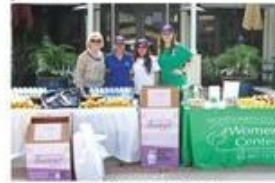
Two Men and a Truck

is called Movers for Moms and several area businesses and organizations partnered this year.