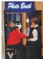
Market Street Photo Booth

Market Street Photo Booth is a featured vendor in The Woodlands Convention & Visitors Bureau 2015 'Nature of Exceptional Meetings' Guide for Meeting & Event Professionals considering The Woodlands for their Corporate and Charity Events