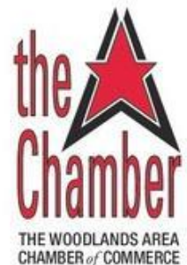
THE WOODLANDS AREA CHAMBER OF COMMERCE