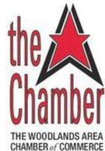
THE WOODLANDS AREA CHAMBER of COMMERCE