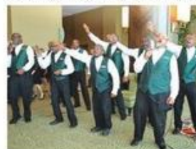
Harbor Light Choir

MW Cleaners recently ran its second annual Tie Drive benefiting the Harbor Light Center and Harbor Light Choir in effort to assist men who have been