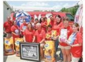
Mr. Rooter Plumbing

Mr. Rooter Plumbing completed their third successful bi-annual food drive to raise awareness in the community