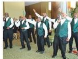
Harbor Light Choir

MW Cleaners recently ran its second annual Tie Drive benefiting the Harbor Light Center and Harbor Light Choir in effort to assist men who have been