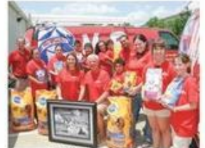
Mr. Rooter Plumbing

Mr. Rooter Plumbing completed their third successful bi-annual food drive to raise awareness in the community